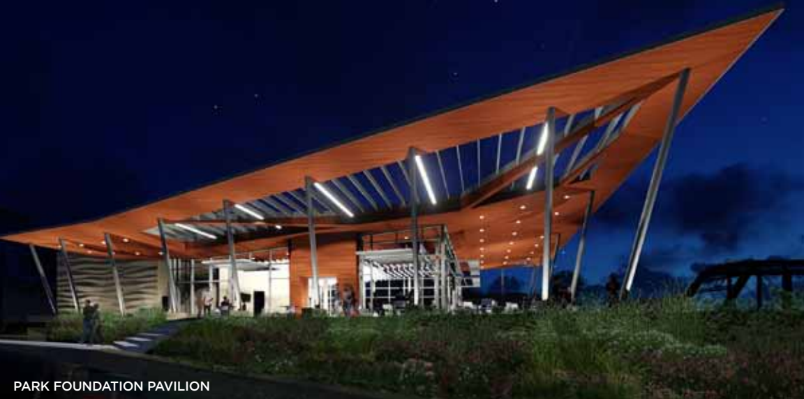
PARK FOUNDATION PAVILION