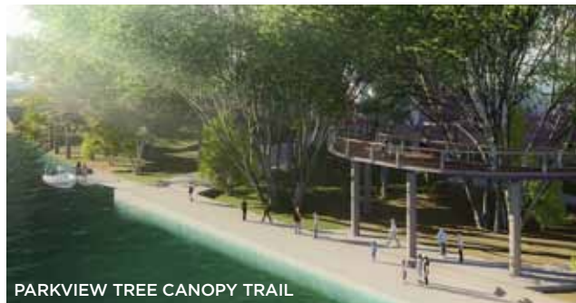
PARKVIEW TREE CANOPY TRAIL

Our rivers help our region tell a powerful story — one that reminds us of our past, gets us excited about our future and engages us in action to bring our plans to fruition.