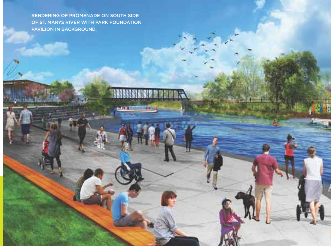
RENDERING OF PROMENADE ON SOUTH SIDE OF ST. MARYS RIVER WITH PARK FOUNDATION PAVILION IN BACKGROUND.